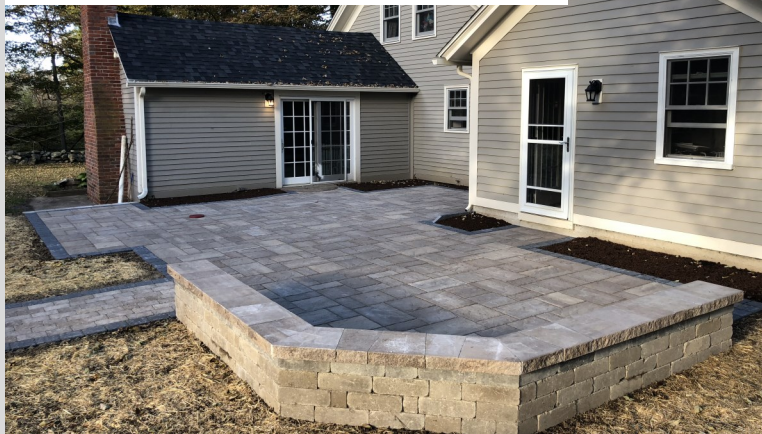
Customize a backyard living area for cleaner usable space and your family's lifestyle...

One of today's hottest trends in outdoor entertaining is incorporating fireplaces, outdoor fire pits, and grills or chimneys in your backyard so you can enjoy a cozy fire during spring, summer, and fall. For decades homeowners out West and down South, have extending their quality time outdoors with family and friends by installing heating elements that are functional as well as enjoyable. Instead of the pool or Jacuzzi that doesn't quite get used as often when company comes over, they create an area with benches and chairs with an inviting fire to gather around safely. Enjoy a delicious meal outdoors and then have a place to converse or to enjoy romantically with that special someone as the evenings start to get cooler but you still want to linger outdoors on a summer night.