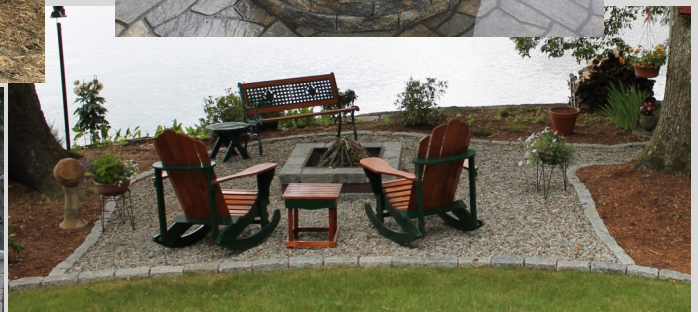
Above is a more informal area to relax and enjoy. Created with cobblestone edging, crushed stone and mulch.