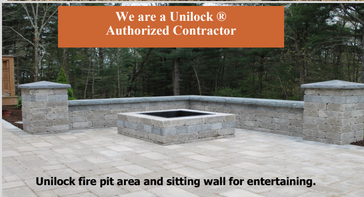
Unilock fire pit area and sitting wall for entertaining.