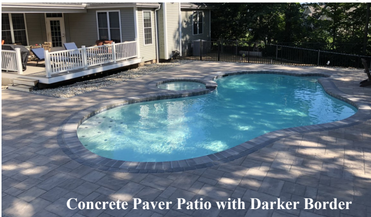
Concrete Paver Patio with Darker Border