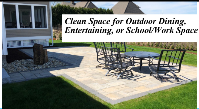
Clean Space for Outdoor Dining, Entertaining, or School/Work Space

Outdoor Patios Areas: Post Covid folks continue to put a lot of thought & planning into their home additions and landscape renovations be it a new or existing home. Cleaner spaces that include the use of partially enclosed gazebos with either canopies or pergolas as a roof for shading and adding privacy. Sometimes an oversized patio umbrella and an outdoor fan is all you need to get some cool shade. Create an outdoor living space with a view of your backyard for the warmer seasons by installing an open gazebo/canopy on a patio with side curtains for privacy and protection from the elements and insects. You can even create different areas on a concrete paver patio for sitting & relaxing with a good book, grilling, enjoying a fire, children's area with picnic table, entertaining with friends around a bar...the ideas are endless. We work with you to plan and budget an outdoor patio designed for your lifestyle and specific needs keeping in mind Smart maintenance and plantings. Add an Outdoor Space for your entertaining or just relaxing after a long day and it will give many years of enjoyment for both family and friends. Call us today for a free consultation & quote and plan now in the winter so you can be ahead of the game and get started sooner by taking advantage of our more flexible spring schedule before warm temperatures arrive and the sooner you can enjoy your space-explore your possibilities today!