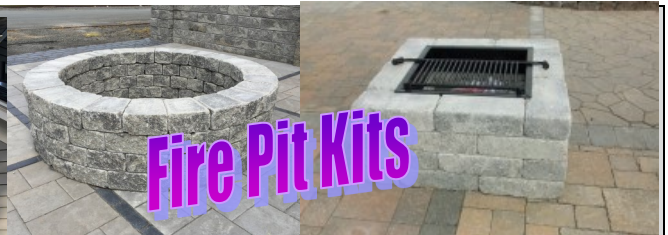
Fire Pit Kits