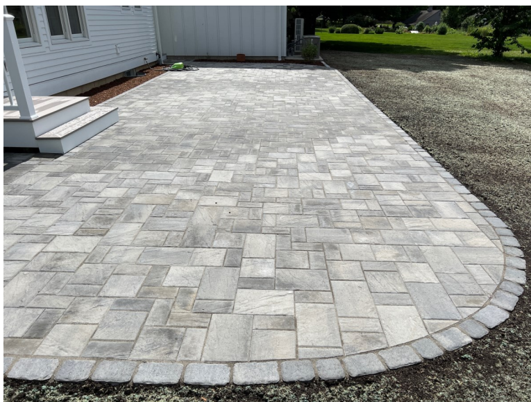
Clean Outdoor Space