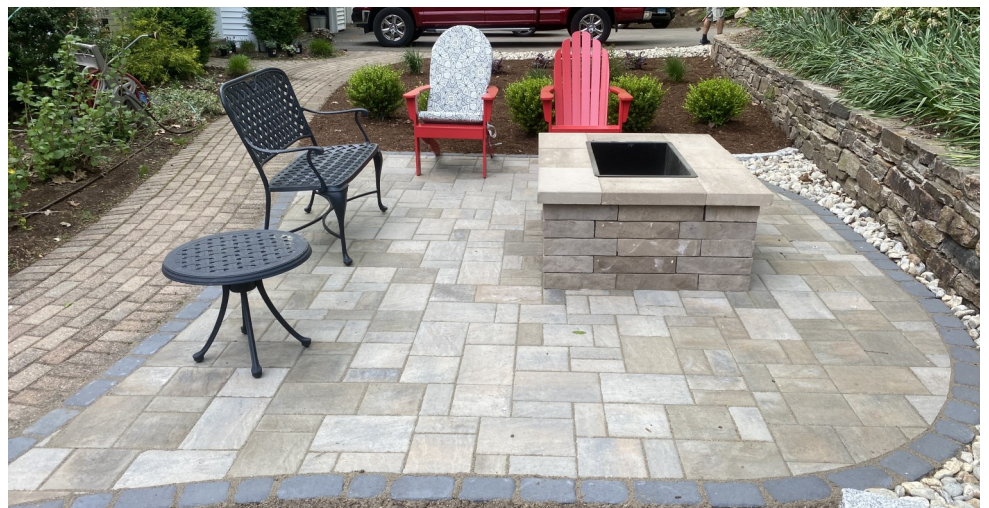
Fire Pit Area.