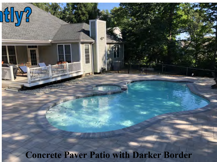
Concrete Paver Patio with Darker Border