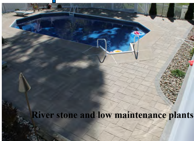
River stone and low maintenance plants