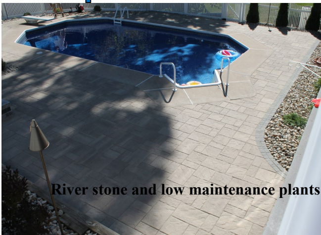
River stone and low maintenance plants