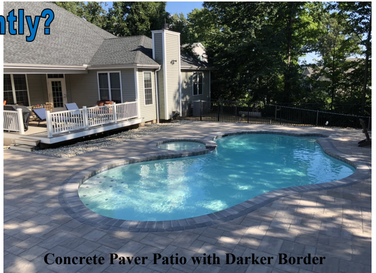
Concrete Paver Patio with Darker Border