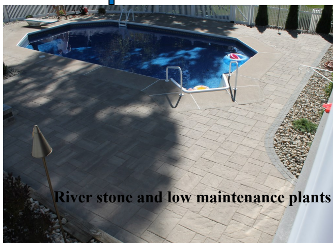
River stone and low maintenance plants