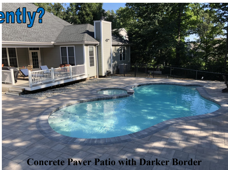
Concrete Paver Patio with Darker Border