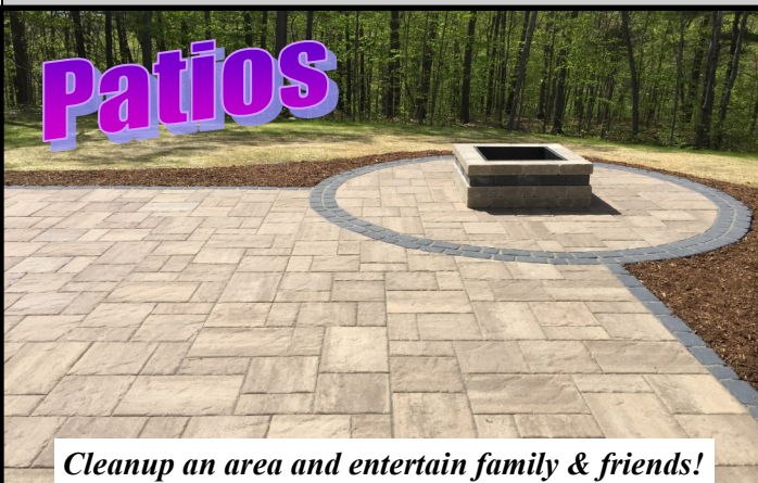
Cleanup an area and entertain family & friends!