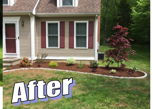
Lower Maintenance Designed Plantings...