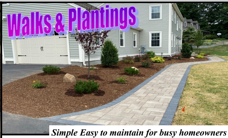
Simple Easy to maintain for busy homeowners