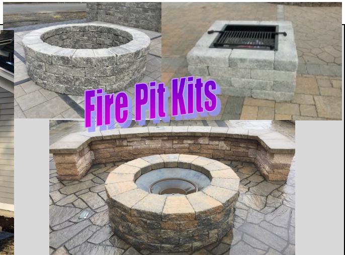
Fire Pit Kits