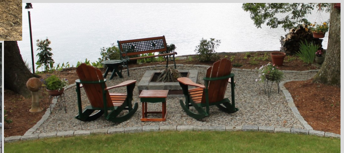
Above is a more informal area to relax and enjoy. Created with cobblestone edging, crushed stone and mulch.