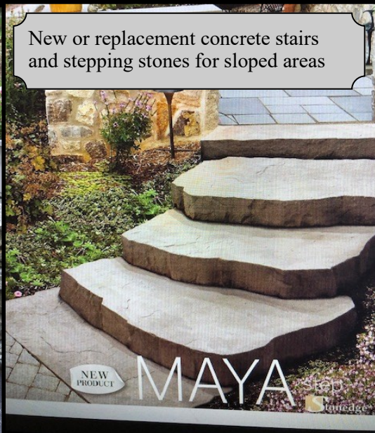
New or replacement concrete stairs and stepping stones for sloped areas