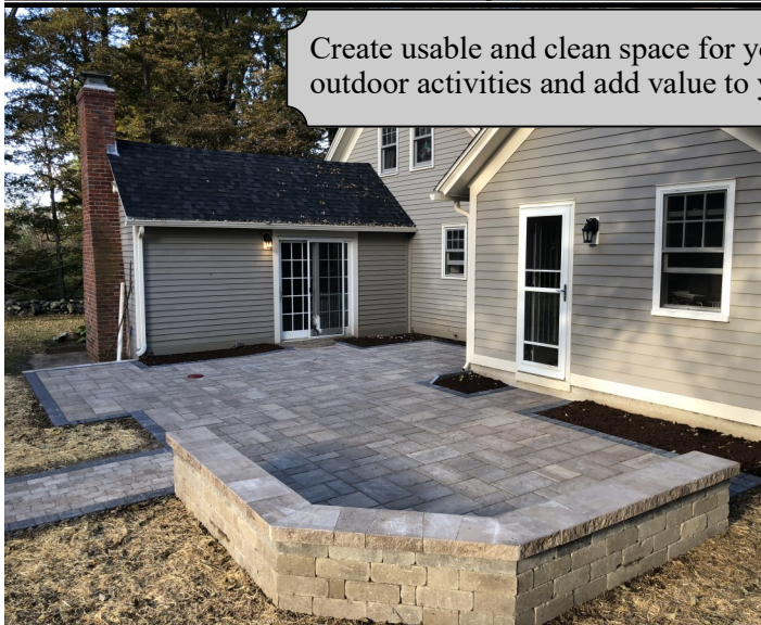
Create usable and clean space for your family's outdoor activities and add value to your home