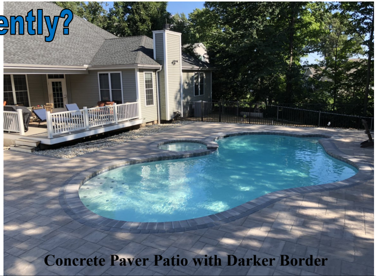
Concrete Paver Patio with Darker Border