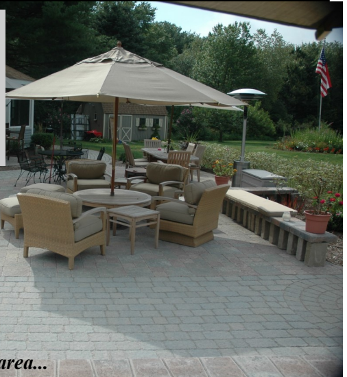
Create an outdoor living area...