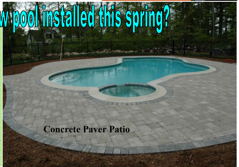
Concrete Paver Patio