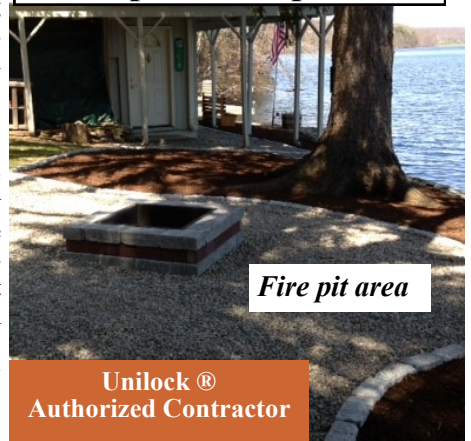
Fire pit area