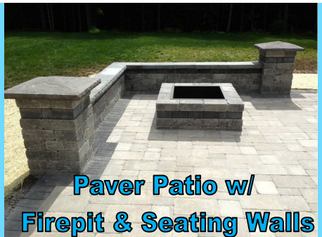
Paver Patio w/ Firepit & Seating Walls

Call us for a free estimate & start planning your backyard retreat!